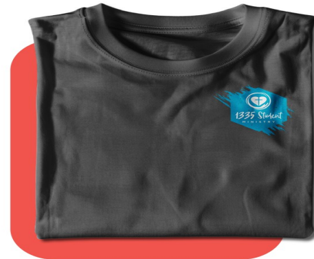
$25 T-Shirt (ADULT XS-6XL)