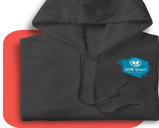
$35 Hoodie (ADULT XS-3XL)